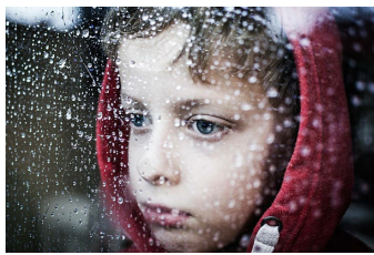
How Predators Groom and Control their Victims