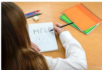
10 Things to Say and Do in a Disclosure of Child Sex Abuse