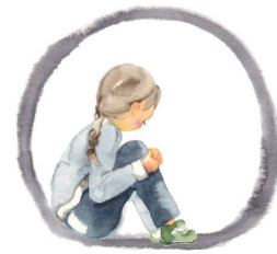
Defending Against Predators of Children